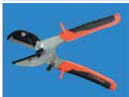
RC 60 Cutter