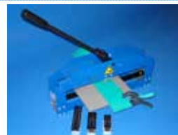
MFT 60 / MFT 130 / MFT 250