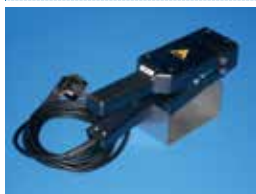
QSP 60 plus