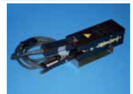
QSP 160 plus