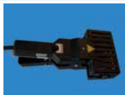
QSP 60LF plus