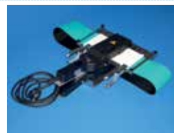
QSP 105 plus