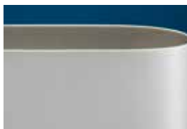
Ropanyl Premium Belt