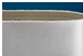
Leading competitor's equivalent belt

*results obtained after identical laboratory tests