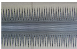
Top and bottomside of belt with Ziplock connection.